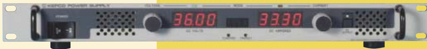
MODEL KLP 75-33-1200 0-75V@16A TO 0-36V@33A

KLP REPLACES THE NEED FOR MULTIPLE POWER SUPPLIES BY EXPANDING THE OPERATING REGION. THE BREAKTHROUGH OF A HYPERBOLIC POWER LIMIT DELIVERS A FULL 1200 WATTS OVER AN EXPANDED OPERATING RANGE, NOT JUST A SINGLE POINT.